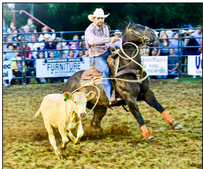
The Hiawassee Pro Rodeo rides back into town for three full days of America's favorite pastime May 26-28.

For the past two years, the event has proven so popular that available seating has sold out every rodeo, requiring a considerable number of fans to enjoy the traditional Western affair either standing around the arena or sitting on the bankside.